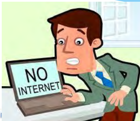
Table 2: The li